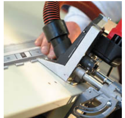
Quick and economical: Making carcasses with the DD40 and dowel template.