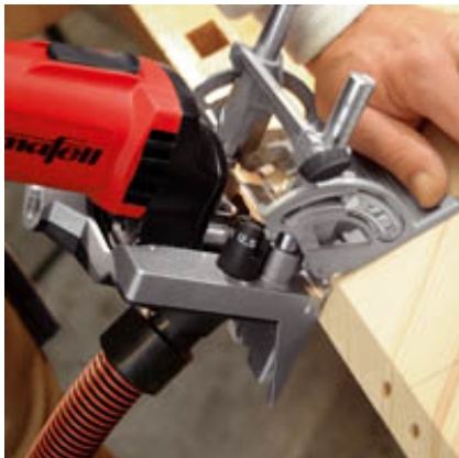
Fast and accurate: Edge-to-edge and mitre corner joints.