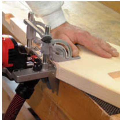
For use in staircase construction, in the workshop and on site.