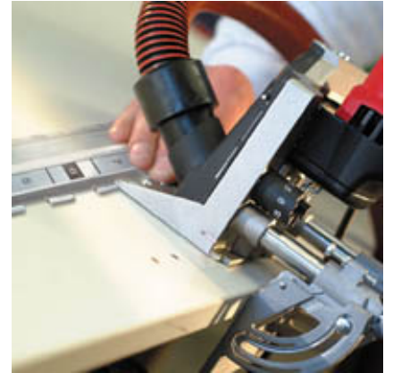
Quick and economical: Making carcasses with the DD40 and dowel template.